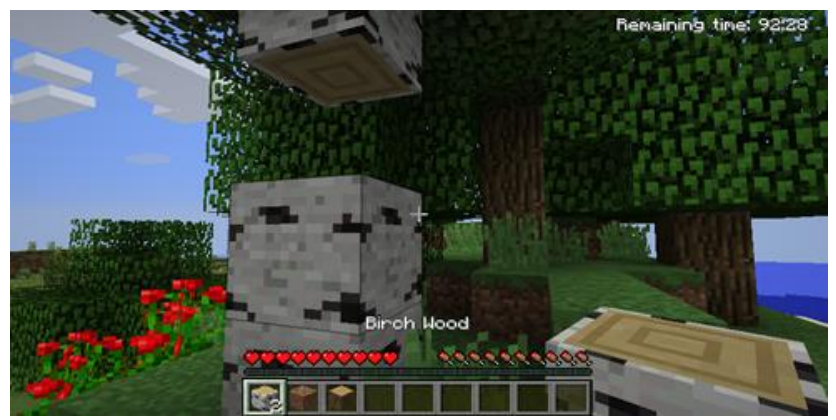
Figure 1. Hewing the trunk of a birch tree in the Java edition of Minecraft .

Efforts intended to give Minecraft 's original visuals a facelift, substituting its purposively retrograde pixelation with high-resolution retextures,<sup>5</sup> do not augment the game's flagship divisibility. Unlike how displacement mapping transforms in-game models to match their textures, in Minecraft the natural granularity implied by a photorealistic texture will far exceed its corresponding polygon's number of triangles resulting in stocky canopies and boulders appearing to have been dipped in a film. Here, one further distinction remains to be made between player ingenuity that aspires to a certain true-to-life naturalism, as when a variety of blocks is expertly masoned together (e.g., a tower constructed from an admixture of different stones, making it somewhat dilapidated in appearance) and photorealism, in which Minecraft's textures are simply replaced. What is unchanged is that Microsoft, which acquired the franchise in late 2014, still abandons players to varying biomes (see Bonner, 2021, 15n), the natural contents of which are quantifiably capturable.