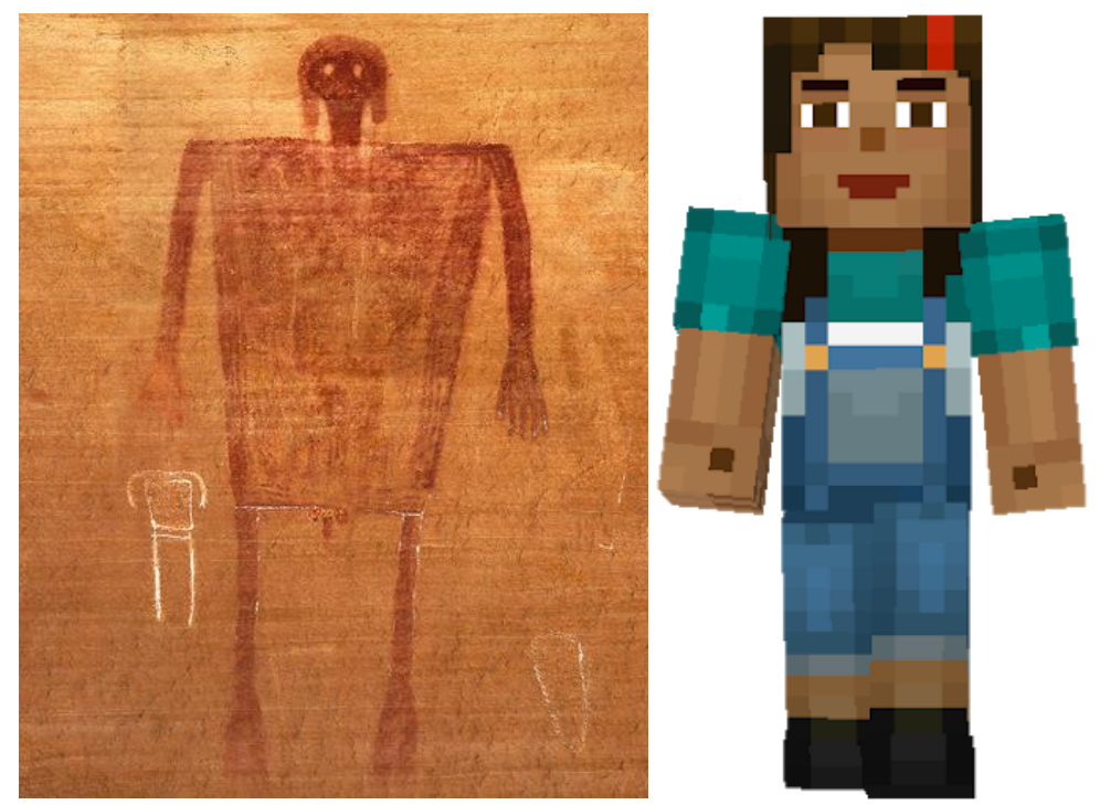
Figure 3. Detail from the Big Man Panel in Grand Gulch, Utah, and a custom Minecraft avatar.

As much as in the cheap figurines marketed to children and manufactured overseas, whose appendages easily dislocate from the torso, there is a partitioned discreteness to the anthropomorphism of Minecraft's block body, as though its most obvious parts were assembled from memory after the fact. Or, for the sake of rote distinguishability, no segment is allowed to overlap.<sup>11</sup> Is this not the way in which children generally approach the drawing of themselves and other people, through ticking off the various physiological necessities? In recollecting the human body's assemblage mnemonically, they know that a bulbous head belongs above the torso, which then sprouts pairs of legs and arms haphazardly, while ankles and wrists are assumed to exist within the respective zones of hands and feet, like the meeting of two perpendicular lines manifesting a corner out of nothing. While Andrew Reinhard (2017), in a critical appropriation of Manuel DeLanda's "assemblage theory," defined as "the idea that independent, unrelated things when combined with each other can create something new with new functionality" (para. 5), gives the parenthetical example of the five robotic lions that combine to form the body of Voltron, the concept of assemblage would seem equally applicable to videogame avatars. Like the figures of Upper Paleolithic art, daubed and spat onto a flat wall,