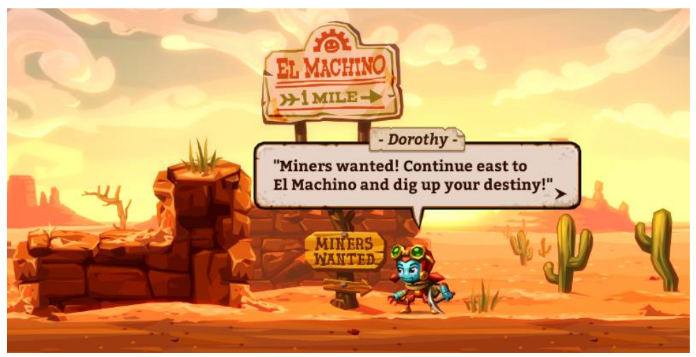
Figure 4. A signpost is interacted with during the exposition of SteamWorld Dig 2 (detail).

Press Start ISSN: 2055-8198 URL: http://press-start.gla.ac.uk