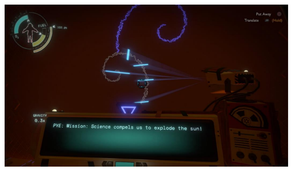
Figure 3. Text log in which a Nomai named Pye discusses exploding the sun.