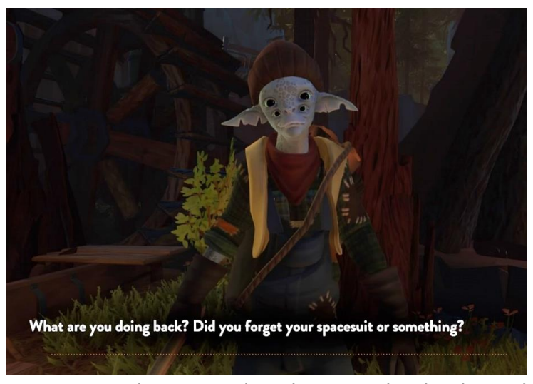
Figure 2. A Hearthian named Marl.

On a basic level, Outer Wilds displaces these humanist and antihumanist conceptions of subjectivity by presenting subjectivity entirely outside the human species. The Nomai and the Hearthians are both nonhuman alien species. Relics and skeletal remains show the Nomai as three-eyed goat-like creatures, whereas the Hearthians are amphibious humanoids with blue skin and four eyes (see Figure 2). Both species are subjects in the sense that they are conscious beings able to create culture and influence their environment, but they are subjects outside humanism and anti-humanism's focus on the human body. Outer Wilds displaces humanism and anti-humanism's anthropocentric focus by representing fully realised subjects outside the human species. Just like humans, the game's aliens are "complex and relational subject[s] framed by embodiment, sexuality, affectivity, empathy and desire as core qualities" (Braidotti, 2013, p. 26). However, as alien species they exist outside the traditionally defined sphere of subjectivity in humanism and anti-humanism which both define the subject in terms of the human and the human body. Outer Wild's representation of subjects therefore moves the definition of subjectivity outside the human.