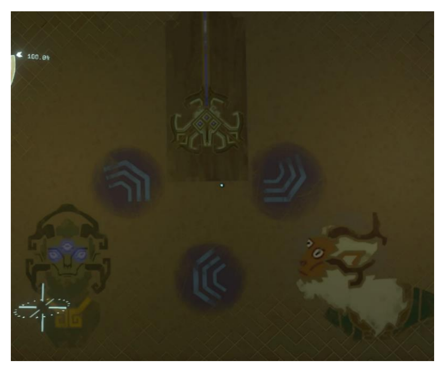
Figure 6. In-game representation of how the Ash Twin Project works to transmit and upload consciousnesses.

The Nomai realise this transhumanist ideal of disembodied subjectivity and create a kind of immortality in the protagonist by preserving the informational pattern of their self in a computer as Ayers discusses. Transhumanism is conceptually linked to the work of cybernetic philosophers such as Norbert Wiener and Gregory Bateson who advocated for removing the human body from a central position in philosophy and conceiving of subjectivity as material information (Wolfe, 2010, pp. xii–xiii). The Nomai's reduction of consciousness to information follows the "cybernetic tradition" and its sense of disembodied subjectivity (Hayles, 1999, p. 7). The Nomai's technology expands their capabilities as subjects—specifically the dramatic extension of life span that Garreau (2006) characterises as a transhumanist goal—to such an extent that they are no longer analogous to humans.