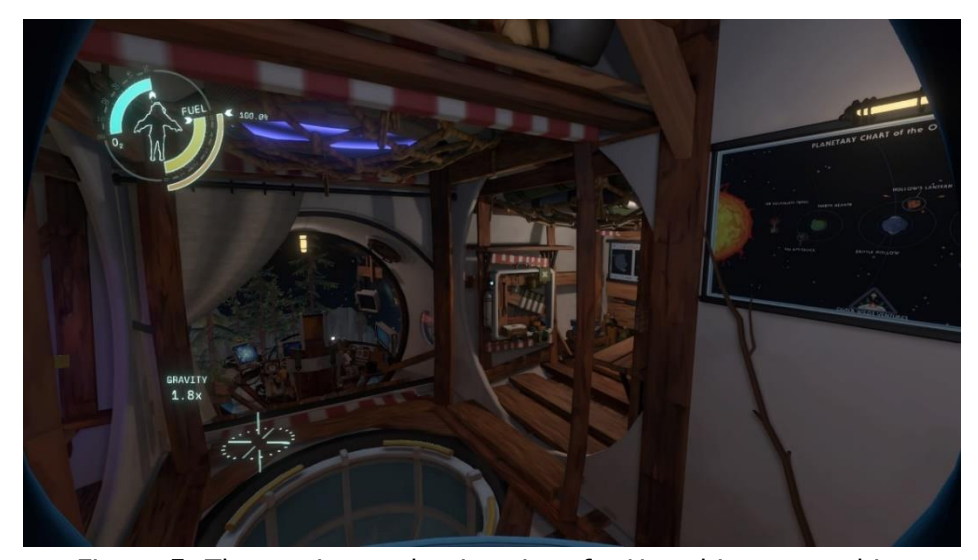
Figure 5. The rustic wooden interior of a Hearthian spaceship.

The Hearthians also retain stricter boundaries between the subject and technology than those exhibited by the Nomai while still demonstrating a subjectivity mediated by technology. For example, the player frequently uses a spacesuit as a technological prosthesis that they can equip and unequip at will: Due to the conditions of space travel requiring the use of the suit, the player is likely to wear it so often that the distinction between the protagonist's body and the spacesuit may be forgotten, which can make it "difficult to distinguish between human beings [or, in this case, the Hearthian] and the technological domain in which they are embedded" (Ezra, 2018, p.6). Yet the ability to remove the suit—even in space when it is fatal to do so—and return to their embodied state unmediated by technology, means that the spacesuit retains the category of tool rather than becoming embedded in Hearthian subjectivity. Hearthians are becoming-machine—they have strong links to their technology and machinery is required for their space