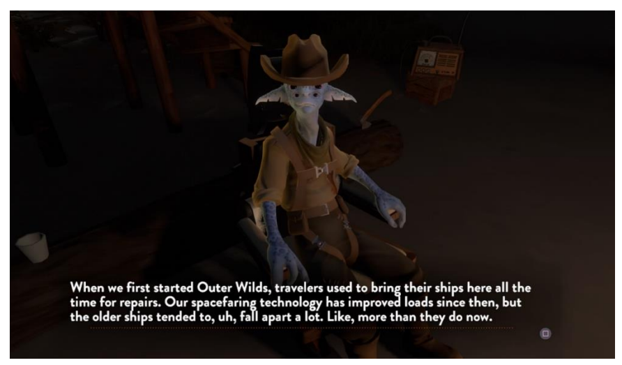
Figure 4. A Hearthian discusses the fragile nature of Hearthian technology.