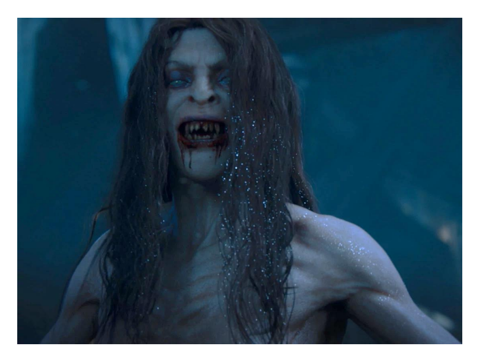
Figure 5. A Bruxa from The Witcher 3: Wild Hunt (CD Projekt RED, 2015)

Screaming or shrieking rarely damages the protagonist, rather it is used to temporarily paralyze him. That a woman's scream could be so stunning or shocking as to render the protagonist immobile and therefore vulnerable speaks to its power as a feminized weapon. As Michel Chion writes in his book The Voice in Cinema (1999), a man's cry is often called a shout rather than a scream, suggesting aggressive power or primal marking of territory. The man's shout is therefore voluntary, calculated, and purposeful, whereas "[t]he woman's cry is rather more like the shout of a human subject ... in the face of death" (Chion, p. 78). The cinematic woman's scream, then, reveals her weakness and fear – she cannot act, she can only utter a non-linguistic, involuntary scream. What of these female monsters, then, who voluntarily use their shrieks as weapons to disarm the men who threaten them? Using their voices as weapons demonstrates how these female monsters are empowered and echoes a tactic taught in many women's self-defence courses: victims are encouraged to shout and scream to startle their attackers and give them an opportunity to escape or fight back. While female monsters in these games never try to escape, they do use the moment in which the protagonist is stunned to fight back.