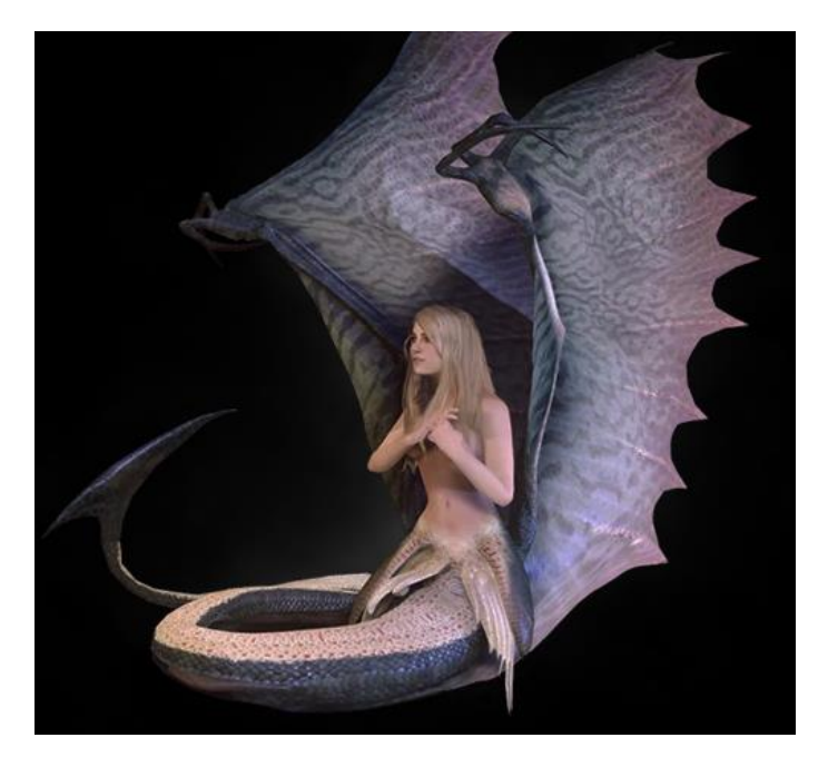
Figure 3. A Siren from The Witcher 3: Wild Hunt (CD Projekt RED, 2015)

approaches them they transform into horrific fish-like monsters with gaping, fang-filled mouths (see figure 4). They, too, deliver an earpiercing shriek which stuns Geralt, allowing them to swoop from the air to bite him and slash at him with their claws and tails.