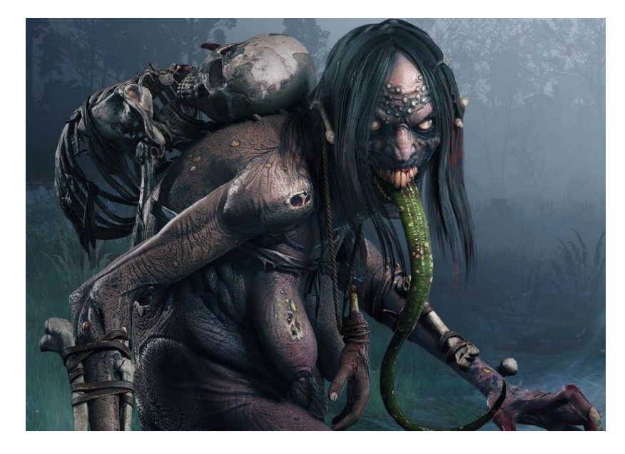
Figure 6. A Grave Hag from The Witcher 3: Wild Hunt (CD Projekt RED, 2015)

Campbell spoke of the fingers and nose, this motif could be easily extended to include the tongue. Many video games feature monsters with long, phallic tongues used to lick or stab their victims, and The Witcher 3 is no exception. In The Witcher 3 's bestiary, the Grave Hag is described as resembling "aged, deformed women" who "loiter near graveyards and battlefields" and devour human corpses (see figure 6). These Grave Hags have long, venomous, prehensile tongues which they use to stab, lick, and whip the player.