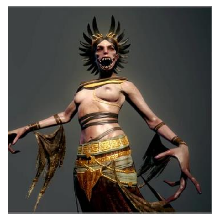
Figure 2. Siren Sybil from God of War: Ascension (Santa Monica Studio, 2013)

In CD Projekt RED's acclaimed dark fantasy role-playing game The Witcher 3: Wild Hunt (2015), the protagonist is a professional monster slayer (or "Witcher") named Geralt of Rivia. Much of the game involves Geralt slaying various monsters for money, and each monster is based on classical Western mythology or European folklore. Sirens appear as half-woman, half-serpent creatures with wings (see figure 3). Although they appear as beautiful, naked women at first, once the protagonist