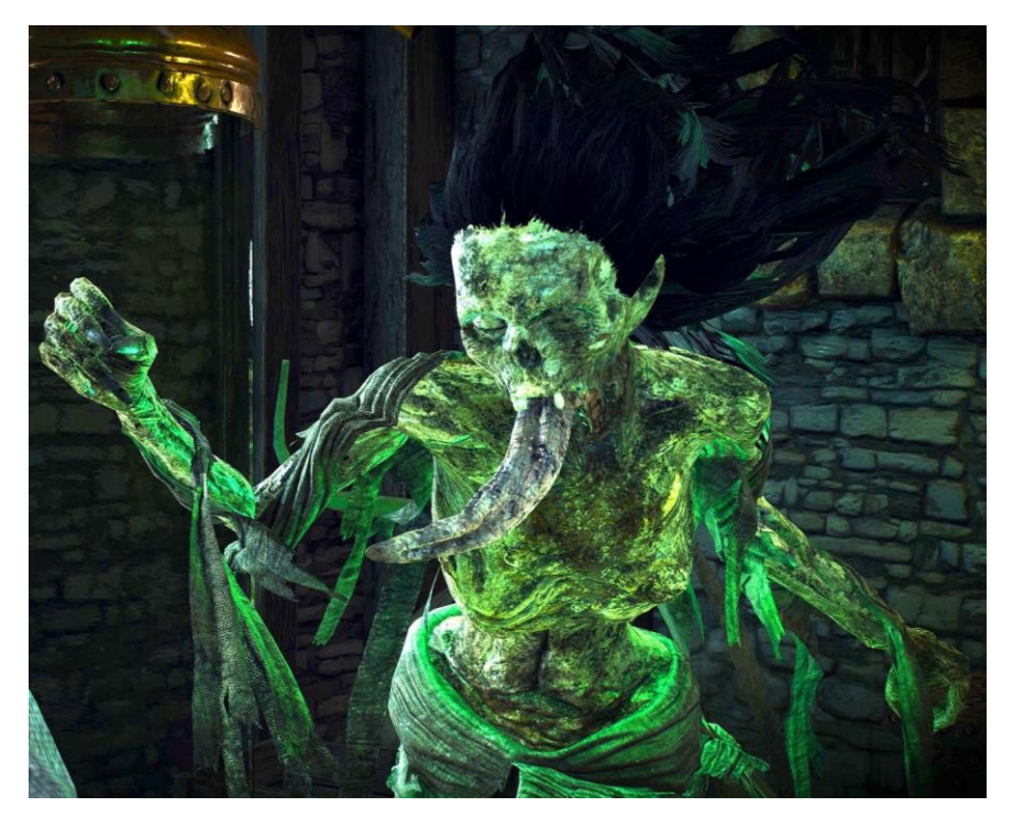
Figure 7. The Plague Maiden, or Pesta, from The Witcher 3: Wild Hunt (CD Projekt RED, 2015)

The monster is an important site of analysis because it speaks to the fears of the culture that produces it. Stephen Neale (1980) discussed horror and monstrosity in his book Genre , arguing that the monster