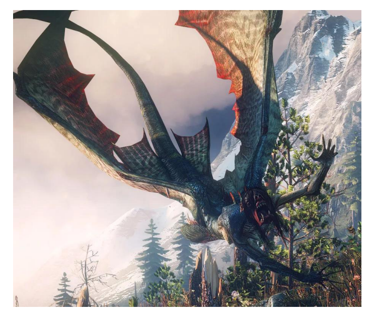
Figure 4. A Siren's true form in The Witcher 3: Wild Hunt (CD Projekt RED, 2015)

The vampire is another traditional monster from classical mythology that has a prominent place in Western media. Throughout their literary and cinematic existence, vampires have been sexualized, gendered monsters, embodying cultural anxieties around class, homosexuality, and female empowerment (Stevenson, 1988; Senf, 1999; Doerkson, 2002; Domínguez-Rué, 2010; Wood, 2015; Zimmerman, 2015). In