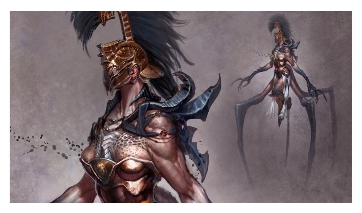
Figure 8. Megaera from God of War: Ascension (Santa Monica Studio, 2013)